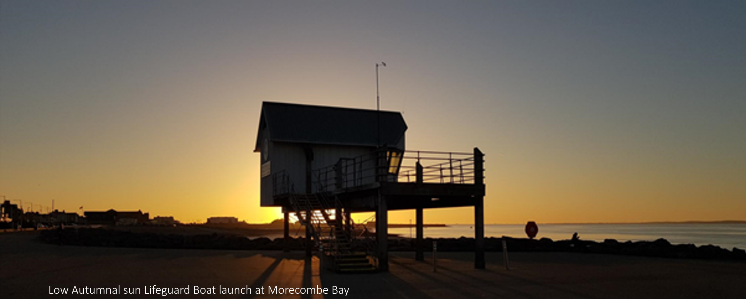
Low Autumnal sun Lifeguard Boat launch at Morecombe Bay

I really liked how the low autumnal sun silhouetted the boat launch in a way that really enhanced it but equally showcased the beauty of Britain's coastal towns. This picture makes you feel that no matter what problems are currently happening in the world, there is a glimmer of hope that we will get through them. It fills you with warmth on a cold day.